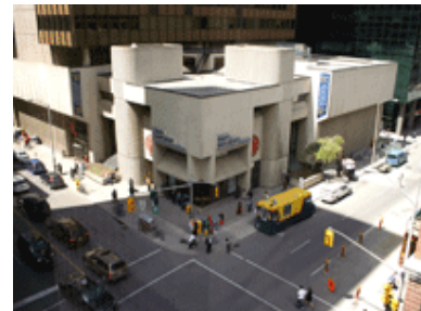
Ottawa Public Library, Main Branch, from "Main – Locations & Hours – Ottawa Public Library"

At the Ottawa Public Library (OPL), readers can check out an experience and "borrow" their way into Canada's largest museum, thanks to a partnership between the Canadian Museum of Civilization Corporation (CMCC), the Canadian Museum of Nature, and the Library. Customers use their library card to sign out a Privilege Card from any library branch. The Privilege Card allows a family (maximum of four people) to discover - or rediscover - the excitement of the Canadian Museum of Civilization, which includes the Canadian Postal Museum and the Canadian Children's Museum, or the Canadian War Museum, at no cost. In 2004, the Canadian Museum of Nature was included in the list of participating institutions, and two other passes have since been added: one for the Canada Science and Technology Museum, and another pass that provides access to 10 smaller local museums. The passes are catalogued in the library collection as realia, are checked out for one week, and are requestible.