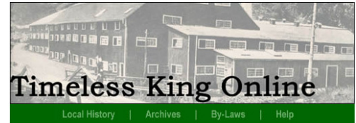
Logo for Timeless King Online, from "Welcome to The King Township Public Library: Heritage."

The public is also being invited to share their historical materials and photos with the Library so that more materials can be catalogued and digitised for future use. This project was supported by a grant from the Ontario Ministry of Culture.