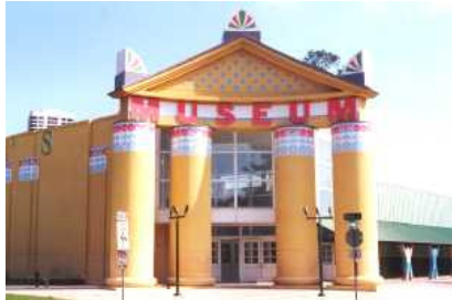
Parent Resource Library, from "About us: The Children's Museum of Houston"

The Parent Resource Library, located in the Children's Museum of Houston, opened in the spring of 1999. Operating as a branch of the Houston Public Library, the library aims, according to the "Parent Resource Library - The Children's Museum of Houston" Web page, to be "a complete resource for parents on all early childhood issues and concerns." Subjects covered in the collection include potty training, cultural issues and discipline. The library also maintains a resource list of other community organizations offering support for parents and families.