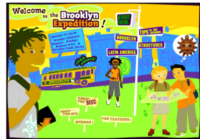
Screenshot of the Brooklyn Expedition homepage: http://www.brooklynexpedition.org

This partnership consists of a web archive of photographs, newspapers, maps and other digitized documents in the collections of the Colorado State Archives and the Denver Public Library, and other local historical societies in Colorado (Walker and Manjarrez 40).