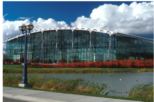
Library and Archives Canada, Preservation Centre, Gatineau, Quebec.