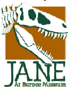
Jane project logo from "Burpee Museum Jane Collaborative Project"