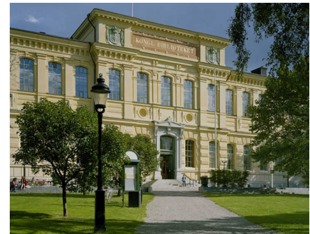
Kungl. Biblioteket, National Library of Sweden (Lindman)

In a joint initiative of the Royal Library, the National Library of Sweden, the National Museum of Sweden, the National Heritage Board, the Swedish National Archives, and the Council for Cultural Affairs, a new secretariat, “ABM-centrum,” was established in 2004. As stated in their online mission statement, “ABM-centrum: Mission statement,” the main goal is to promote understanding and collaboration between archives, libraries, and museums, with an emphasis on the development of digital projects.